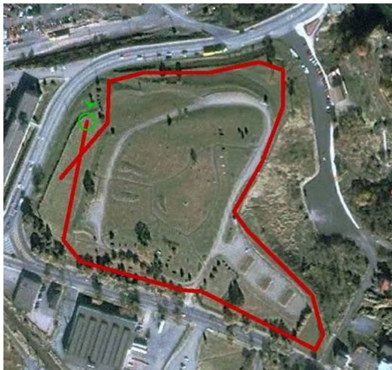
1.1 km Loop